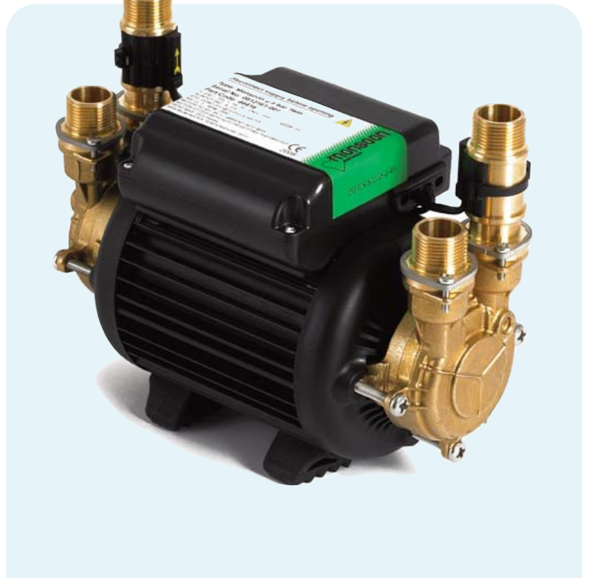
Monsoon Standard Twin Pumps