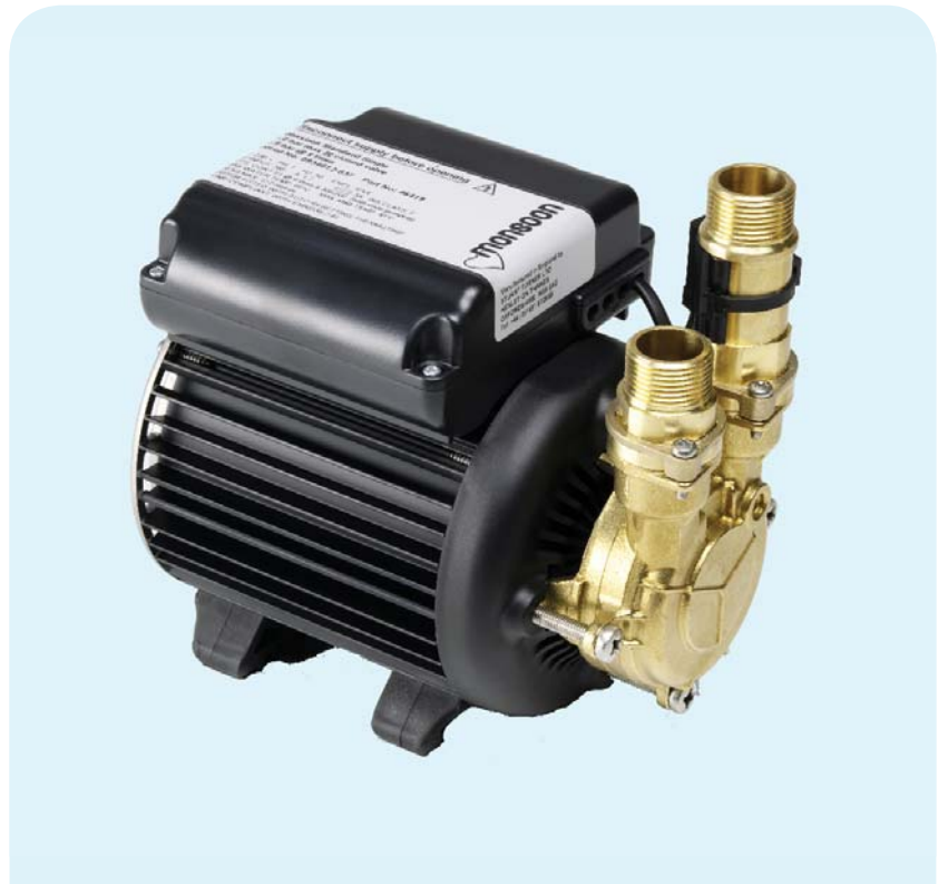
Monsoon Standard Single Pumps