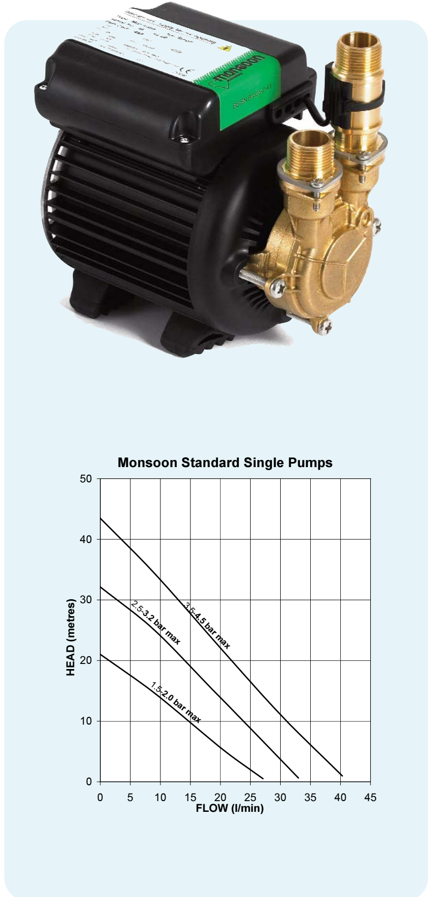
Monsoon Standard Single Pumps