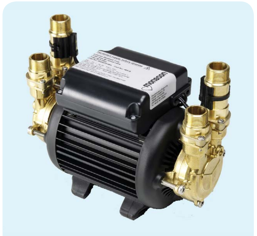
Monsoon Standard Twin Pumps