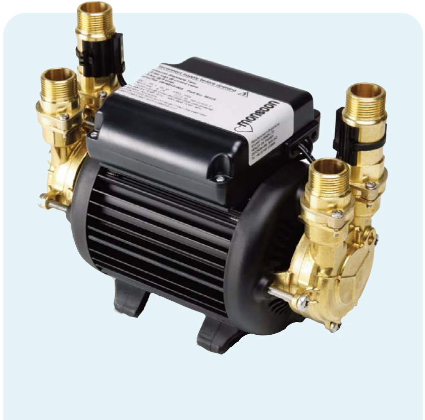
Monsoon Standard Twin Pumps