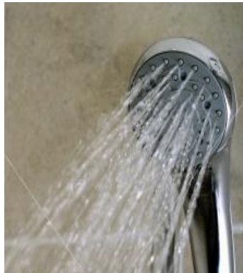
1.5 - 3.0 bar Medium Boost