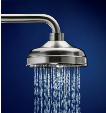
0.5 - 1.5 bar Low Boost