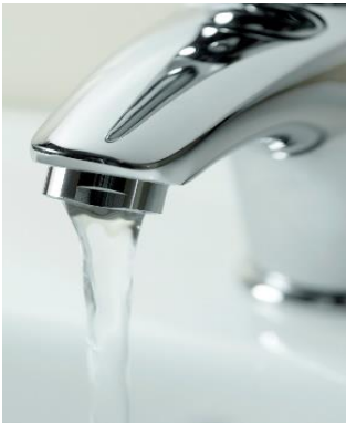
0.1 - 0.5 bar Gravity

Pumps are rated in 'bar' and typical ratings range from 1.5 bar to 4.5 bar.